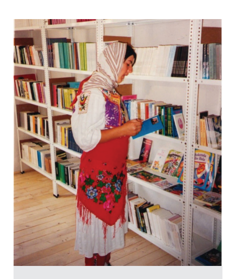
■ A Hasi girl at the library