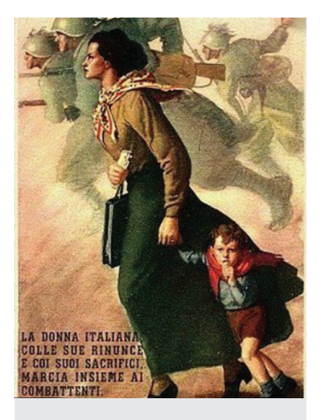
Propaganda poster in the period of Fascist Italy. Translated text:

Gender scholars argue that nation, national identity, and nationalism function through gender. They have emphasized that women, in the nationalist outlook and practice, as cultural forms, as embodied signifiers and activists, play a biological role in social reproduction.